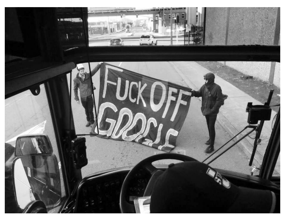
Excerpt from «To Our Friends», translations coming soon. @anosamis - bloom0101.org